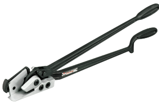
Model CU-25 | Part No. 005740 For strap removal or cutting strap to length. Replaceable blades. Cuts strap through 2" x 0.050" (50.8 mm x 1.27 mm). Shipping weight: 8 lbs. (3.6 kg)