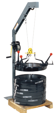
Stationary model Part No. 425650