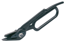
Model CY-30 | Part No. 426010 Heavy-duty alloy steel. Cuts strap through 1-1/4" x 0.035" (31.8 mm x 0.89 mm). Shipping weight: 3 lbs. (1.35 kg)