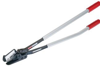
Model CU-25LH | Part No. 0X-1528 Extra long handle cutter. Replaceable blades. Cuts strap through 2" x 0.050" (50.8 mm x 1.27 mm). Shipping weight: 8 lbs. (3.6 kg)