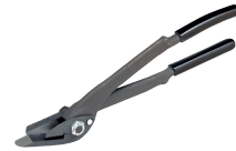
Model CU-30 | Part No. 005899 Lightweight. One-hand operation. Cuts strap through 1-1/4" x 0.035" (31.8 mm x 0.89 mm). Shipping weight: 3 lbs. (1.35 kg)