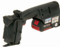
GripPack Cutter | Part No. 800770 For strap removal or cutting strap to length. Cuts through two straps up to 1-1/4" x 0.044" (31.8 mm x 1.12 mm). Shipping weight: 7.5 lbs. (3.4 kg) See page 11 for battery and charger - sold separately)