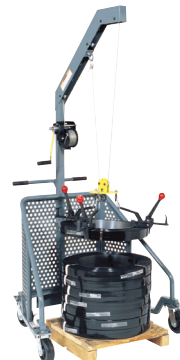
Portable model Part No. 424700